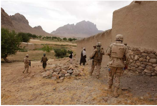
3rd Plt on patrol

Security is tight concerning specifics on locations, operations and casualties. India Company is operating in the general area of Marjah in Helmand Province in south central Afghanistan. The province includes a fertile river valley with developed irrigation and is the prime opium poppy growing area in Afghanistan. The general mission includes providing security for shopping bazaars and for farmers so they can grow alternative crops to opium without interference from the Taliban. The Taliban rely on opium to finance a large part of their operations. Part of the mission is to provide a secure environment for the Afghan government to establish itself in the Marjah area. The following pictures show India Company and other 3/7 units.