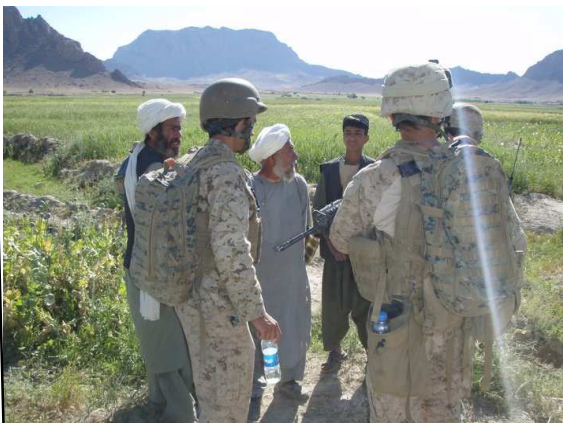
Afghan soldier and Marine with poppy farmers

2011 Myrtle Beach Reunion April 27-30, 2011 Compass Cove Oceanfront Resort Myrtle Beach, SC Reservations at 1-800-228-9894 Oceanfront Rooms and Jr. Suites $74 to $84 + 13% tax