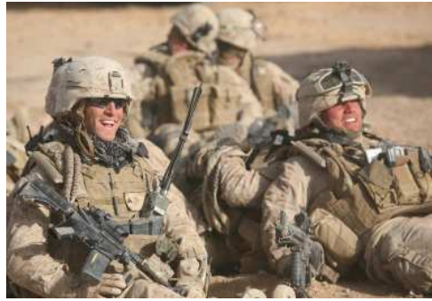
India Co. Marines on a break