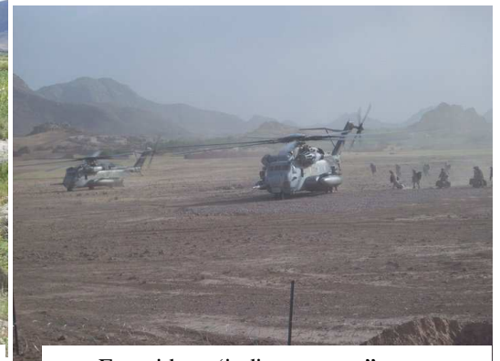
Free ride to 'indian country'