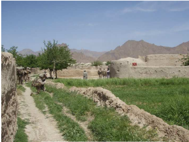
Patrol through village