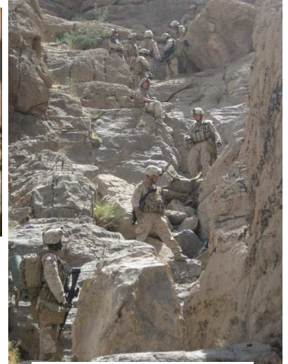
Patrol in the rocks